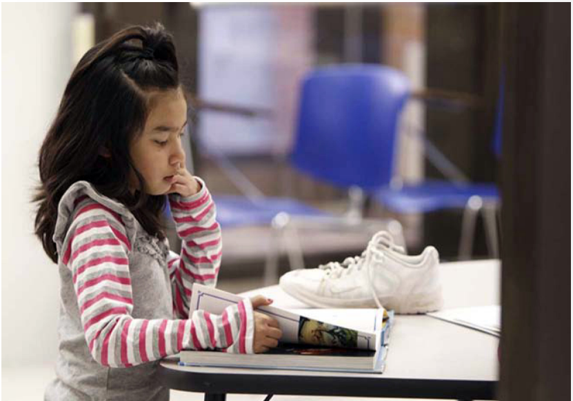
Special Learning Inc. Photo/Chris Keels Photography