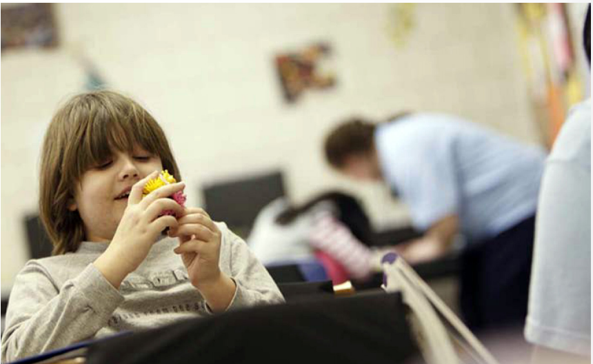
Special Learning Inc.

If any of these symptoms are present, a formal evaluation is recommended. Many children diagnosed with mild symptoms grow up to be independent and successful individuals. Problems with social interaction may still be experienced, but may be controlled. With early and proper intervention and family support, there is a high possibility that child with Severity Level 1 ASD will lead a fulfilling life.